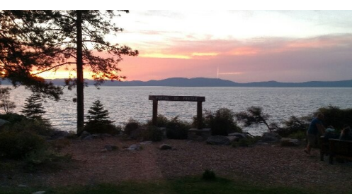
Sunset near the portal of prayer.