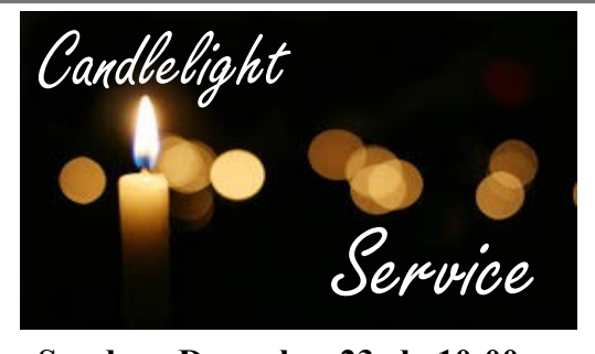
Sunday, December 23rd, 10:00 am

This year, our Christmas Eve Service will be celebrated during our regular 10:00 am service. Celebrate this time of year with an hour of song and story. Watch the light spread throughout our sanctuary during our beautiful candlelight service.