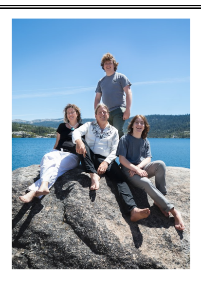
Radiant Being Concert Sunday, September 25th, 12:30 p.m. $20 Suggested Love Offering

Music to inspire and enlighten your own radiant being!